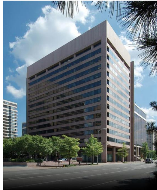
The new Crystal City office building at 1235 South Clark Street offers visibility from the Jefferson Davis Highway as well as close proximity to the Pentagon.

On the other side of Washington, CTC has an office in Annapolis Junction, Maryland. The company maintains a presence at several other locations around the country, where we can best support our clients.